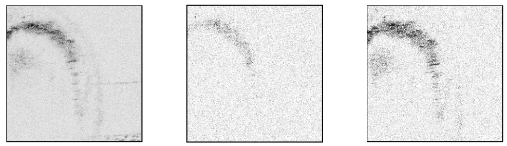
Fig. 2: Structural & magnetomechanical OCT images of the dorsal side of an in vivo Xenopus laevis exposed to magnetite powder. Left: Structural OCT image. Center: Magnemagnetical OCT image with the magnetic field off. Right: Magnetomechanical OCT image with the magnetic field alternating on/off between consecutive axial scans. Image dimensions are 1mm by 1mm. Pixel values for magnetomechanical images were evaluated by differencing the OCT signal between adjacent scan lines (difference between scattering with field on vs. off).

was modulating or completely off. However, the tadpoles exposed to magnetic contrast agents consistently showed a large increase in the magnetic signal when the external magnetic field was applied, in comparison to the control. Ferrofluid-filled microspheres as described above have also been imaged within this animal model with positive results.